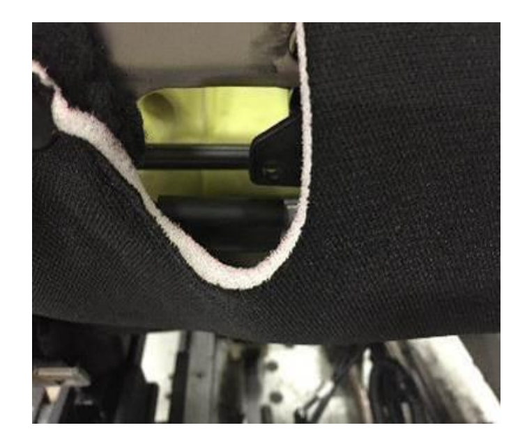
Fig. 4 Install New Back Panel

4. Install new back panel (Fig. 4). Refer to the detailed service procedures available in DealerCONNECT> TechCONNECT under: Service Info>23 - Body> Seats, Front> Panel, Seat Back> Installation.