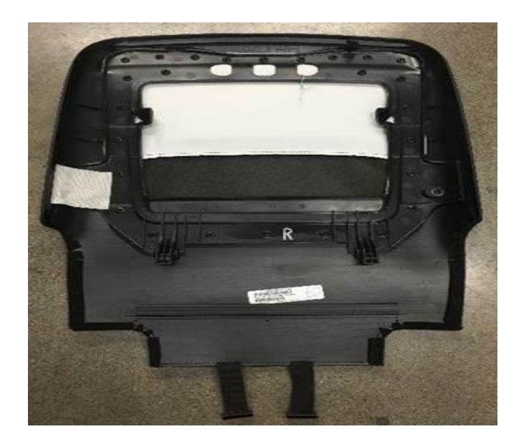
Fig. 1 Rear seat back

Remove old back panel (Fig. 1). Refer to the detailed service procedures available in DealerCONNECT> TechCONNECT under: Service Info>23 - Body> Seats, Front> Panel, Seat Back> Removal.