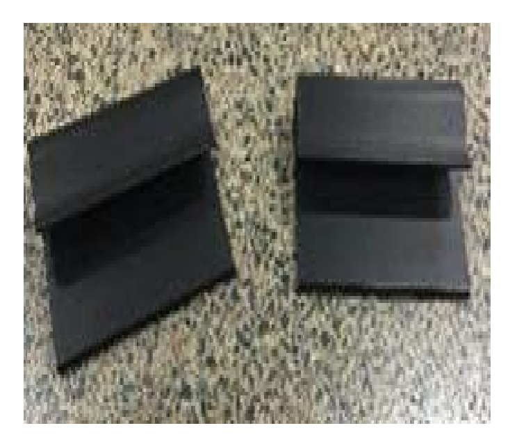
Fig. 2 Seat Back Retainers

2. Cut retainers off the old back panel and save them (Fig. 2).